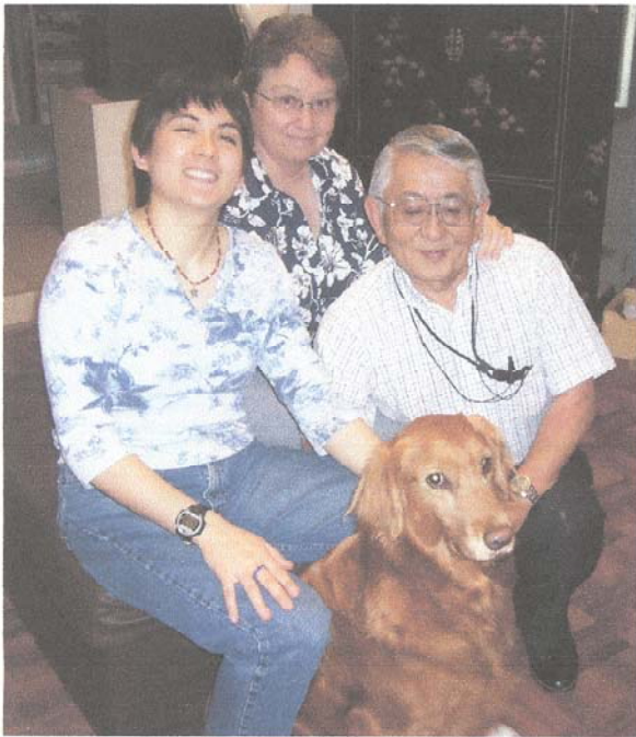
Mum, Dad, Me and Pebbles at home.