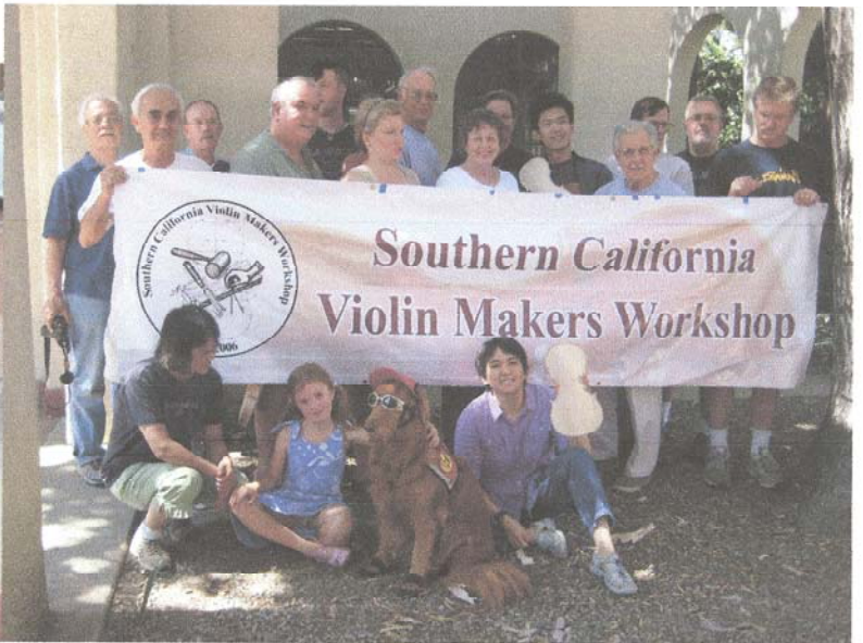
Pebbles in full sun protection gear After all, we do live in Arizona.