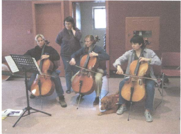
Cello playing to try out newly made bows.