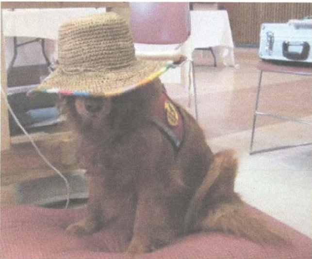
Pebbles goofing off in a rest period.