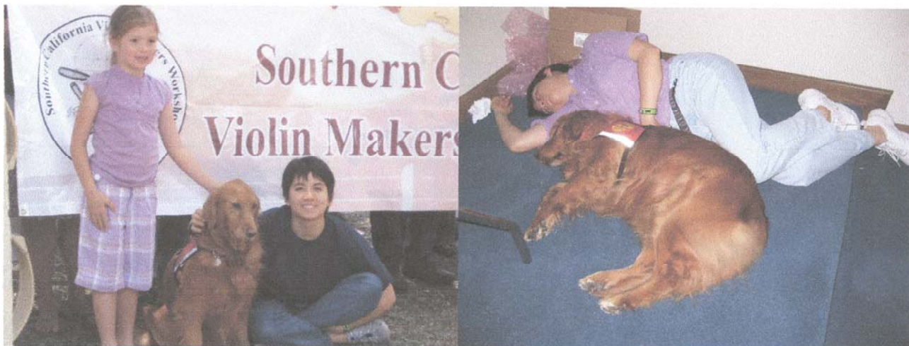
Snuggling together during a busy work day.

After my surgery I decided to train to repair violins and have been attending workshops in Eureka (CA), Claremont (CA), and Albuquerque (NM) for 5 years now. Never knowing we would need photos of Pebbles working, the only photos I have are from the workshops.